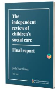
The Independent Review of Children’s Social Care

Three reviews were published last year, provided impetus and vision to transform children’s social care.